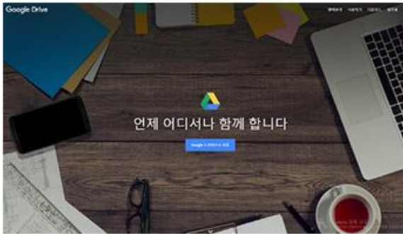
1. Log on to your google account and go to google drive