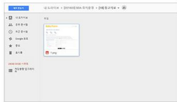
2. Upload video on your personal drive account